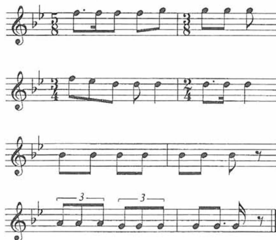
Ex.4 Large compass terme tune reduced to a four-line scheme

Ex.4 is also like that. The tune outlines the scheme S^k S^k M' R R M M R^k D D D D D \mid S^k S^k F_k R \uparrow \mid F^k R^k D D D^k D^k D^k D^k D \mid D^k D D \mid R^k T^k L \mid T^k T^k T^k L^k S, S, S, L + S_{cad} . Towards the end, the tune sinks to lower sol , which is a unique feature. The four-line scheme reduced from that suggests a round song form S^k M' R D , as the next example confirms. Such tunes can also be found in the descending fifth-shifting pentatonic strata of Hungarian folk music.