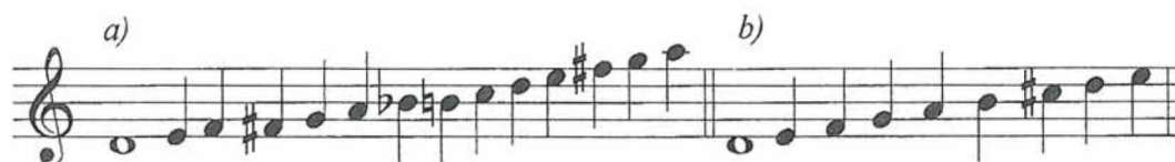
Figure 1. The scale of the dombra

The Kazakh dombra has two strings, tuned to a fourth (or, less frequently, to a fifth) and tied-on frets. It may be the forerunner of the Russian balalaika . Its western form is pearl-shaped and has 14 frets, while the eastern model has a spade-shaped or triangular body and seven or eight frets. The dombra is often played with a strum, striking both strings simultaneously. The scale of the dombra varies regionally in Kazakhstan. In the next figure we show the scales of the dombbras . Fretless play can extend this scale somewhat. 1