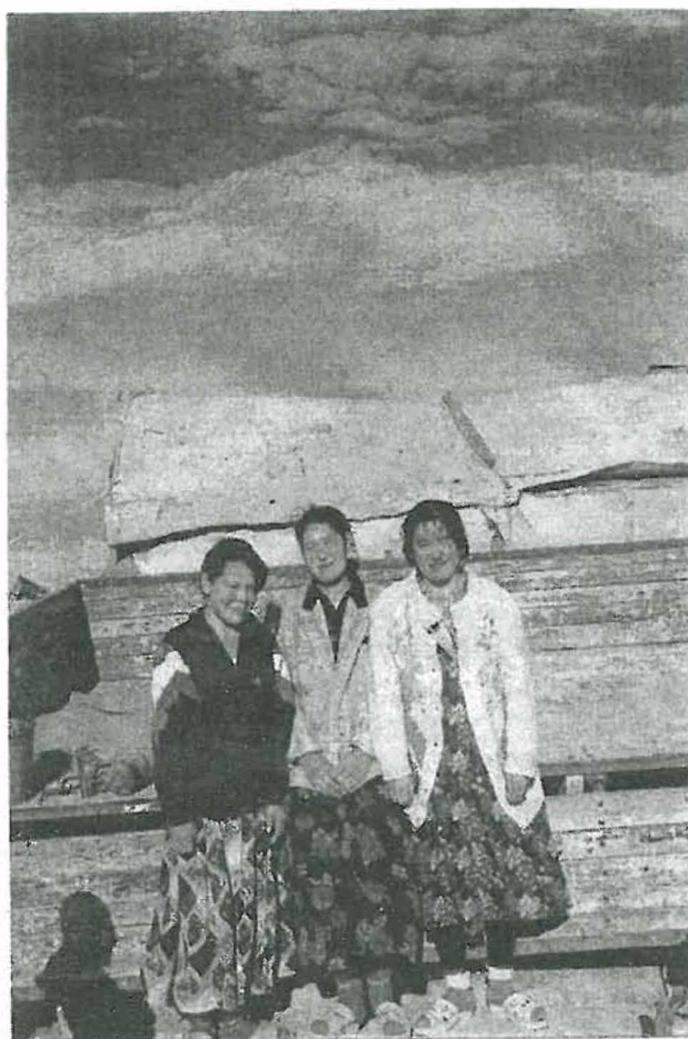
Picture Üst-Yurt, nomad camp